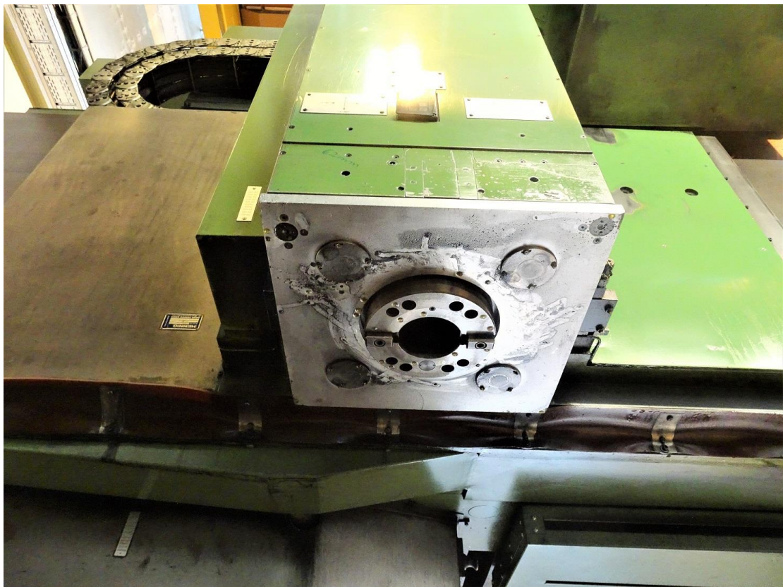
ram (600 x 600 mm) type machine with protection plate