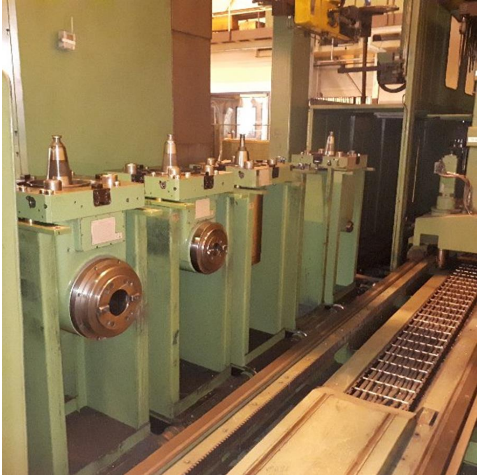
RAA and extension