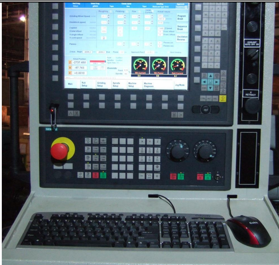
new operators panel