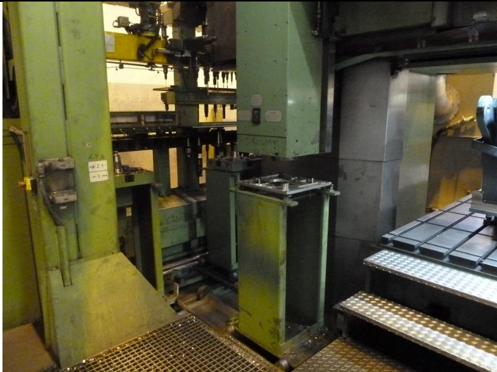
mounting position for RAA