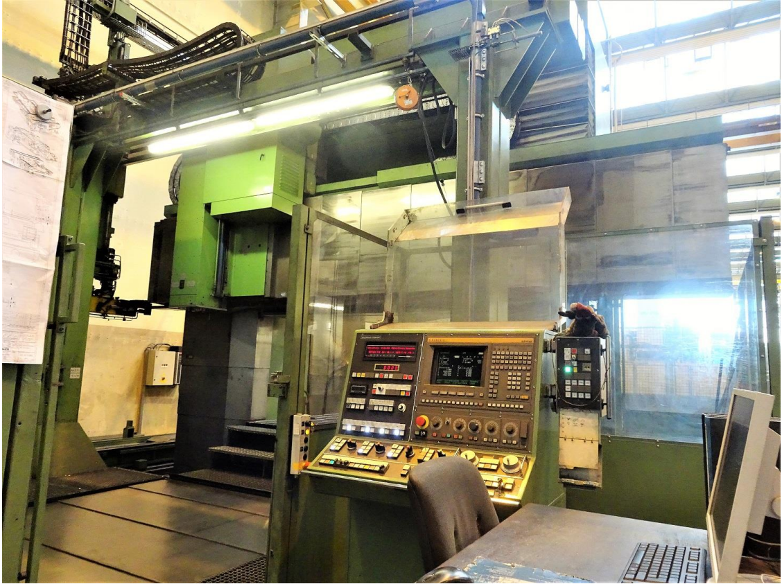
Machine at production place Gebr. HELLER Nürtingen, Germany