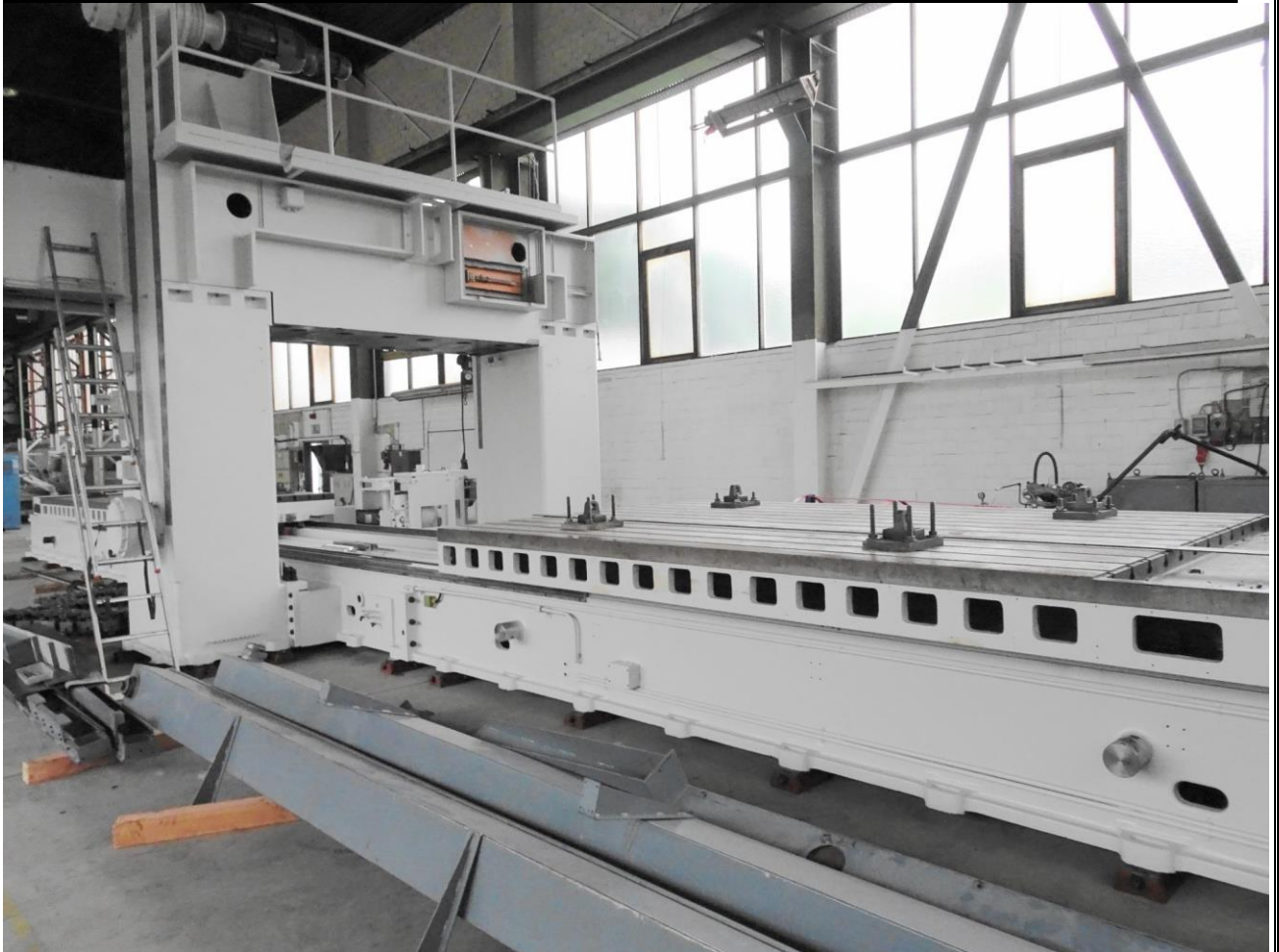
back side of the machine