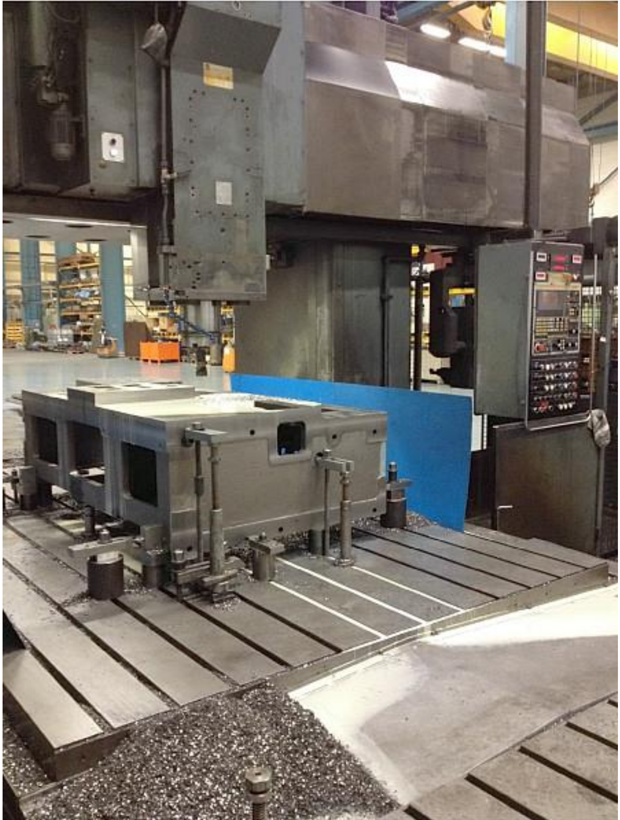
machine at former production place in ram + quill design