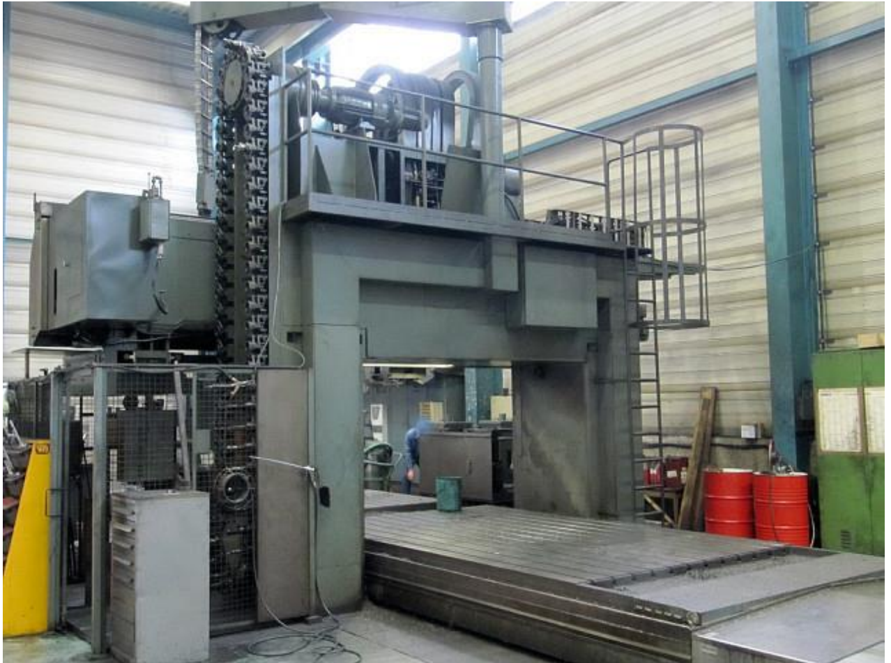
tool changer with 60 places