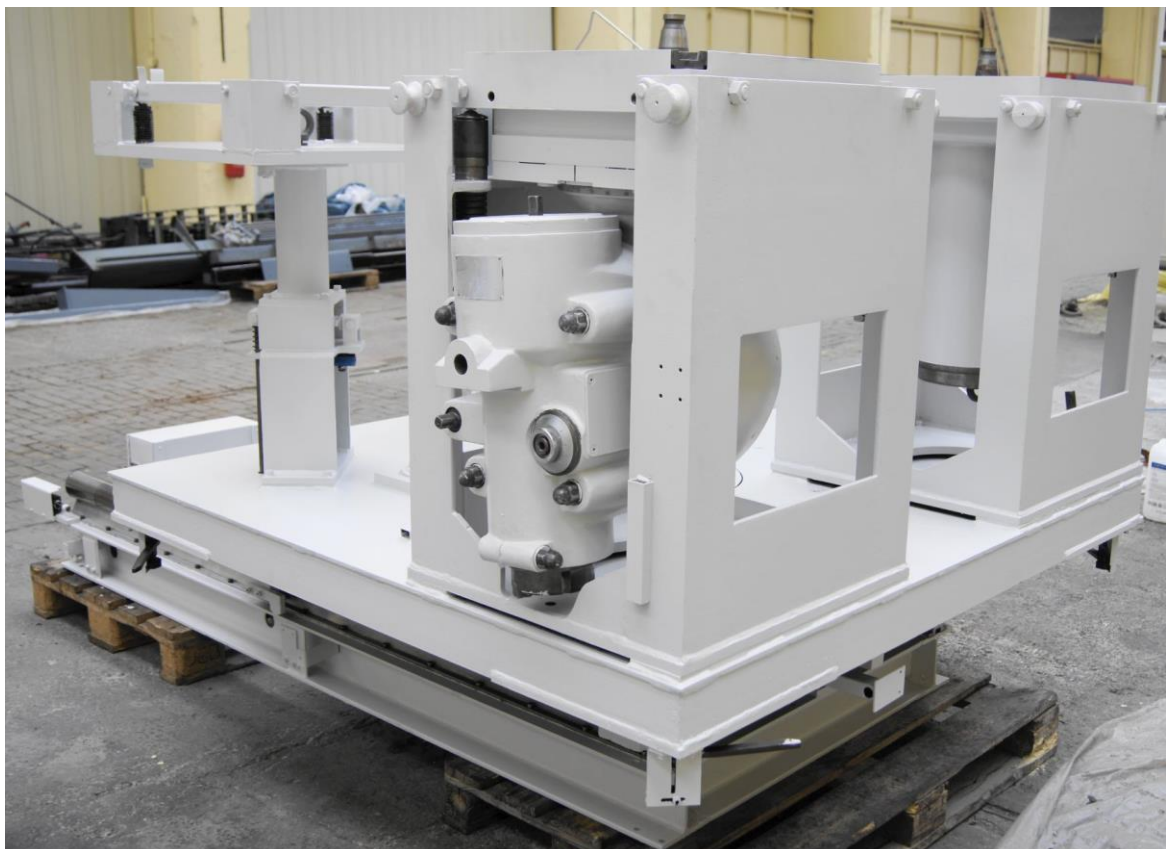
universal - RAA