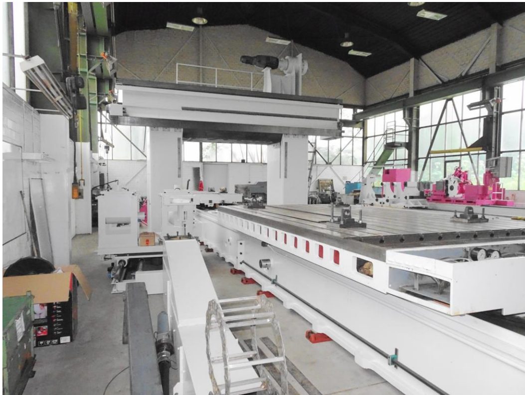
machine in remanufacturing process

new CNC control SINUMERIK ONE, new electric cabinet