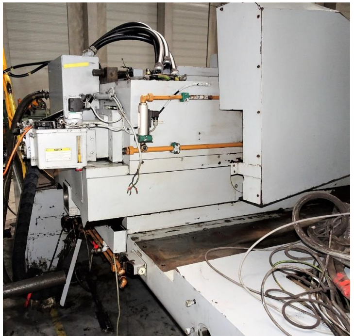
CNC controlled grinding carriage