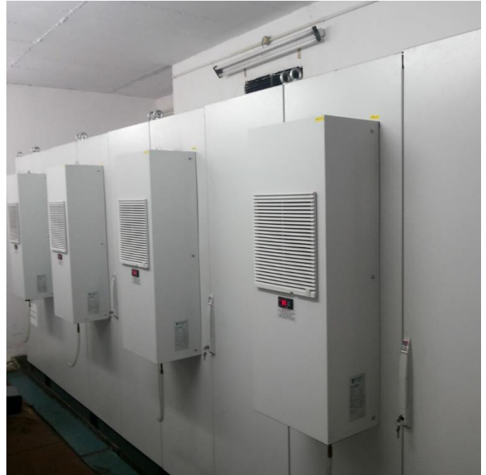
new electric cabinet