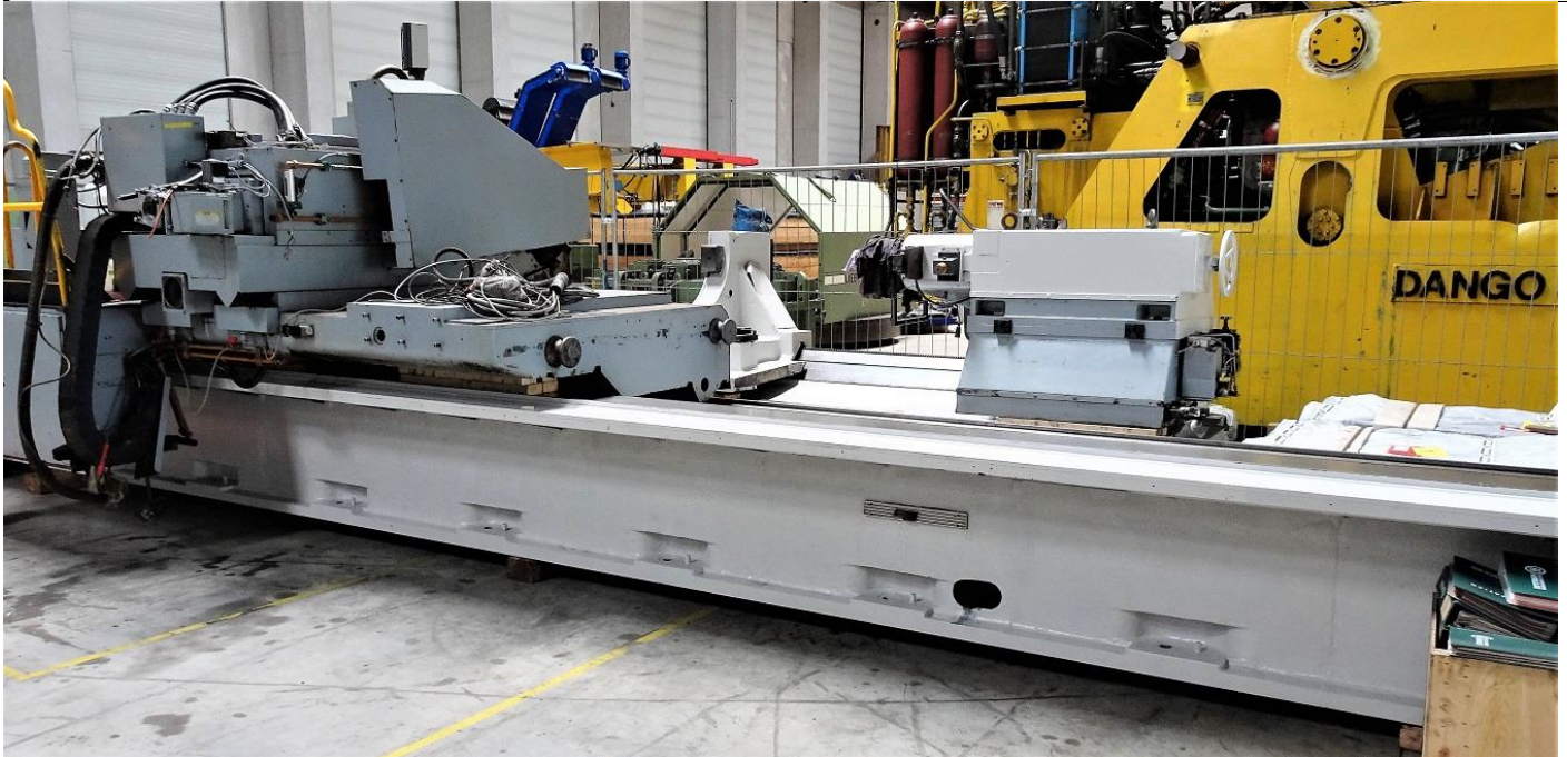
Machine is stored in our warehouse.