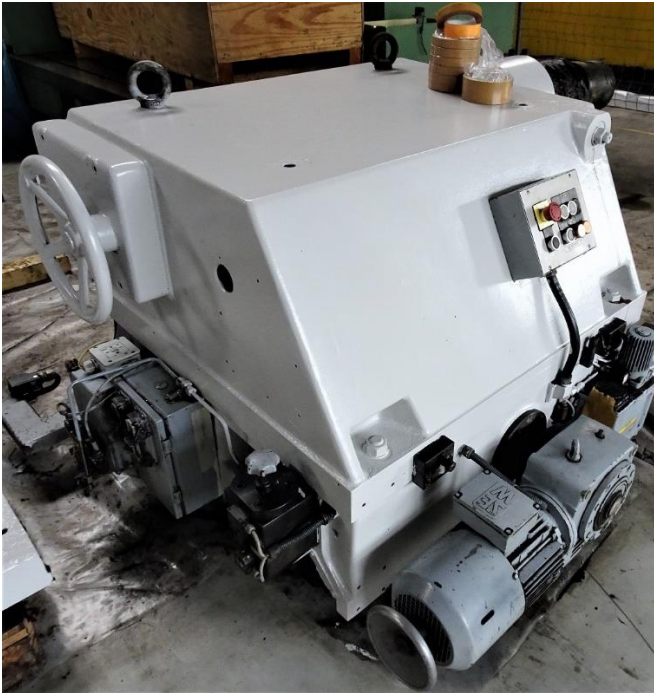
Tailstock, automatically controlled through CNC