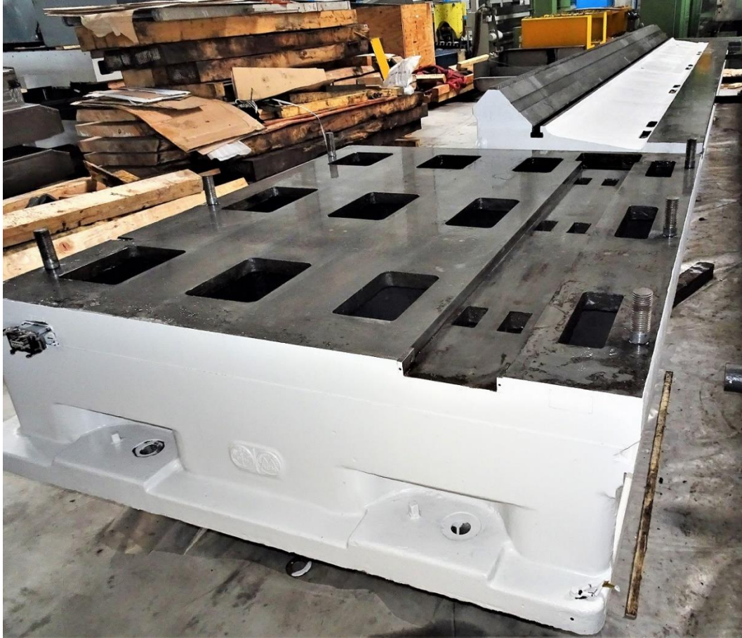
Bed work piece side cleaned, new painted and new scraped.