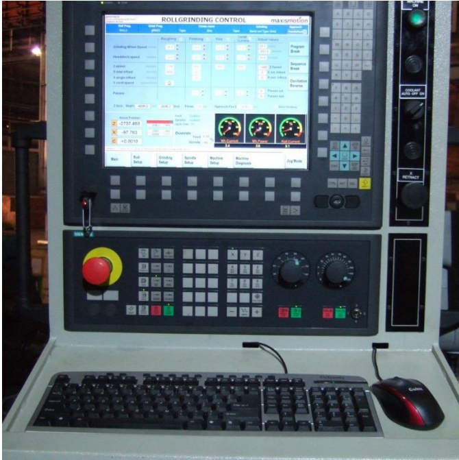
new operators panel