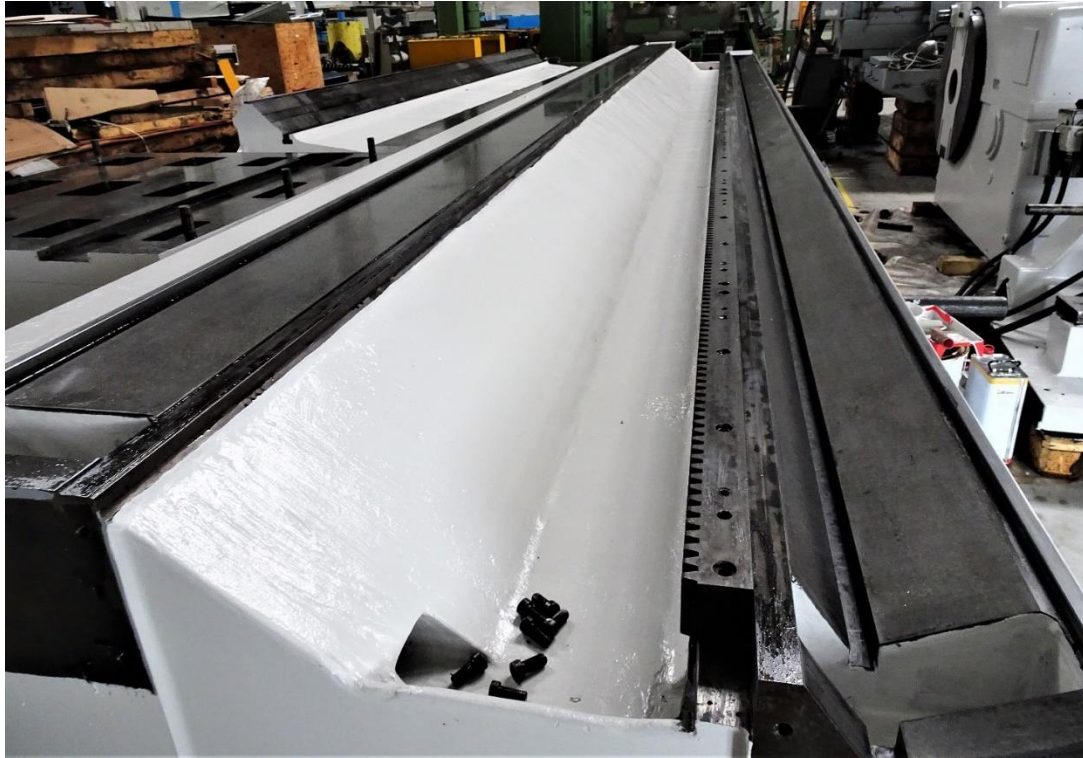
Bed grinding side, cleaned and new painted. New telescopic way covers for the bed.