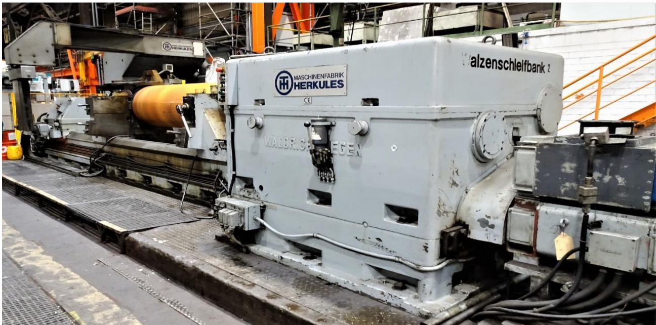
machine under production at Salzgitter Steelworks