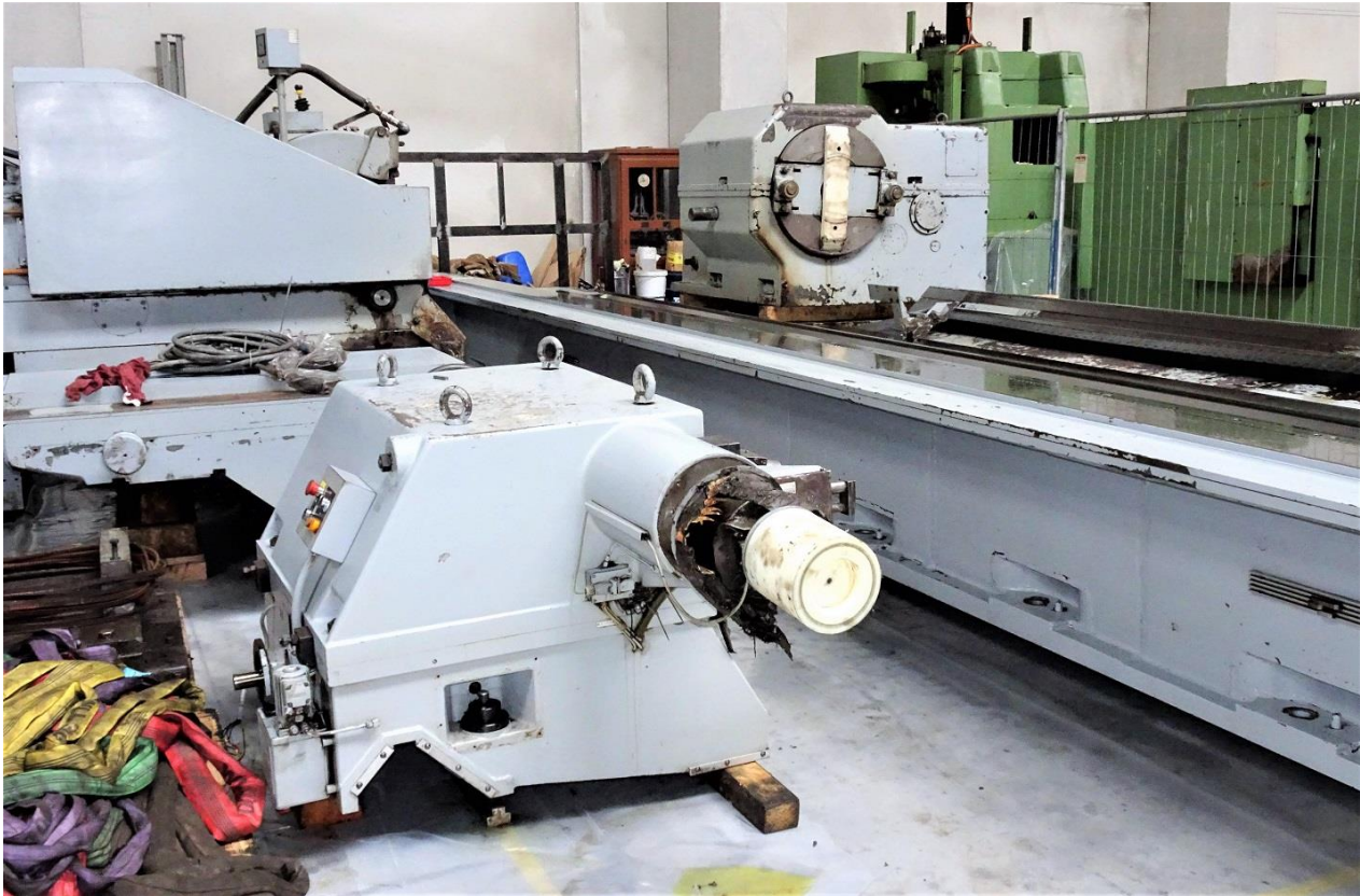
machine, stored in our warehouse in Freudenberg