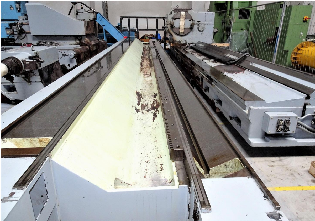
guideways like new