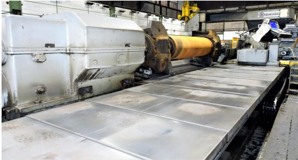
machine under production