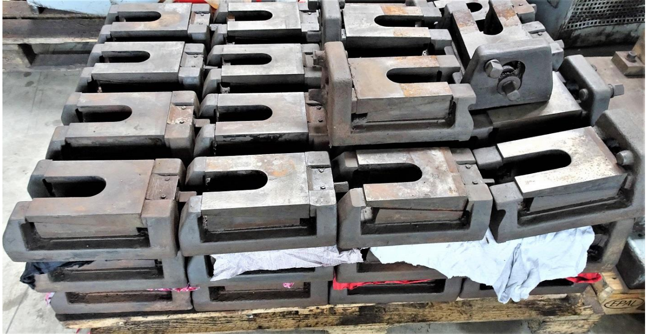
complete set of leveling wedges

Dipl. Ing. Elmar Ernst Industrieanlagen GmbH Hüttenfeld 8 (street) D - 51427 Bergisch Gladbach (city) Tel. +49 2204 9844010 Fax +49 2204 9844011 mob +49 172 1520295 email: maschinen@web.de www.ernstmachines.de