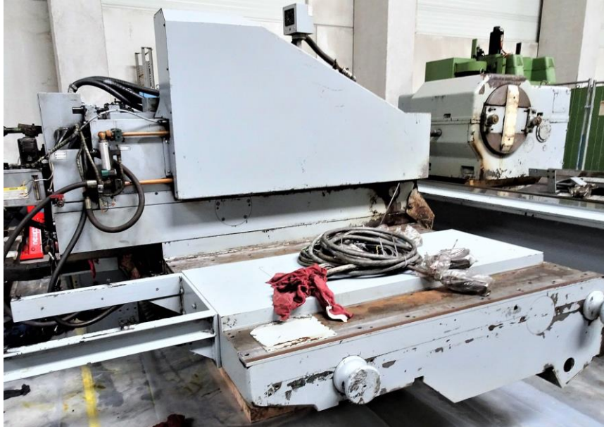
grinding carriage of the machine